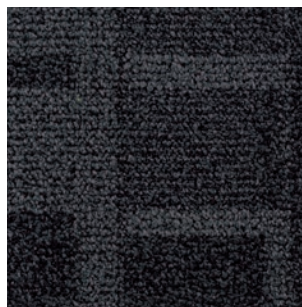
Essence Maze 9991