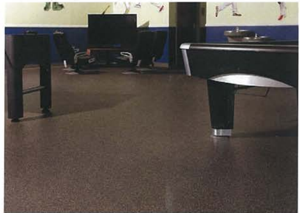
everroll® Tone a durable surface for pubs, hotels and games rooms

Refer to the Product Selector for more applications