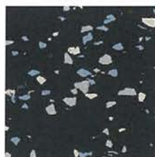
everroll® Tone Nome