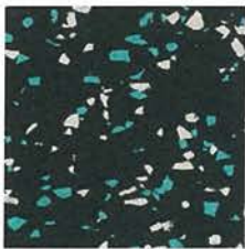
everroll® Tone Auckland