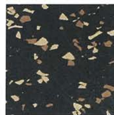
everroll® Tone Kush