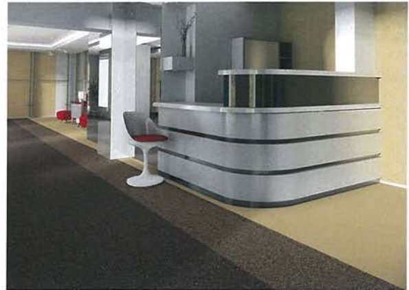
everroll® Tone mixed with Vitality and Shape Kush looks great in reception spaces

Also observe how the extra compliment of colour provides an added dimension to design. Get your hands on a sample, survey the eight colour combinations to select the optimum product specs for your space.