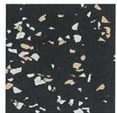
everroll® Tone Lhasa