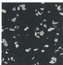
everroll® Tone Berlin