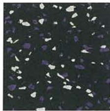
everroll® Tone Perth