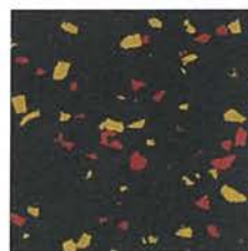
everroll® Tone Goa