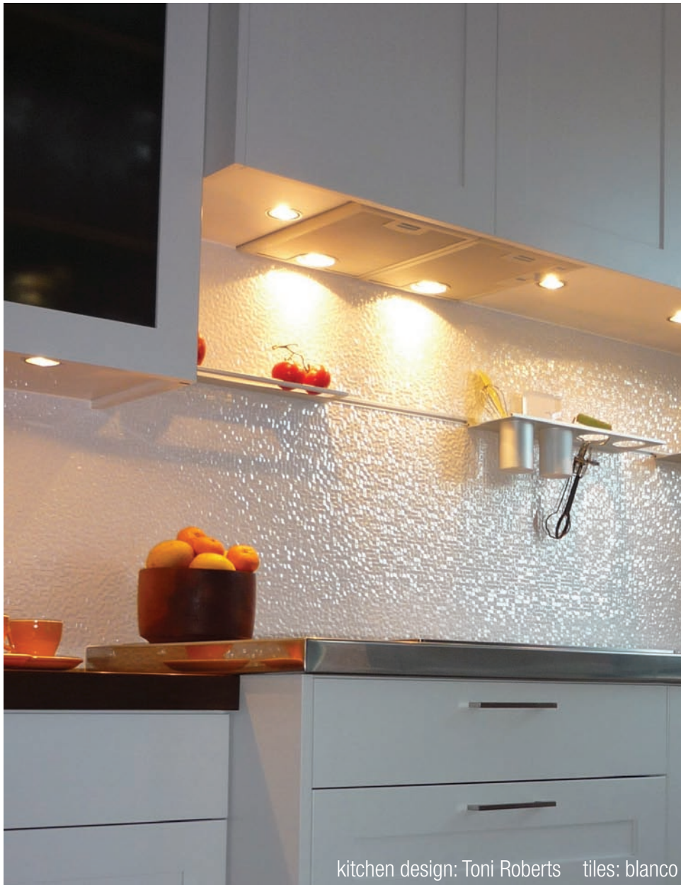
kitchen design: Toni Roberts tiles: blanco