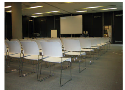
Everroll is the perfect class/lecture room floor...resilient and extremely quiet.