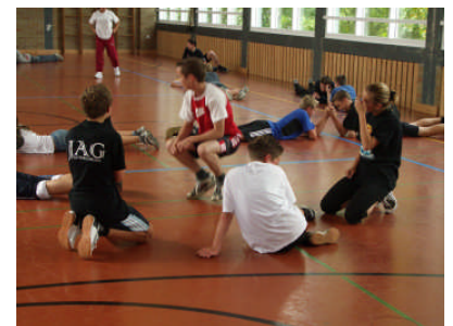
Regupol offers children the impact resistance they need when playing and the insulating comfort when resting.