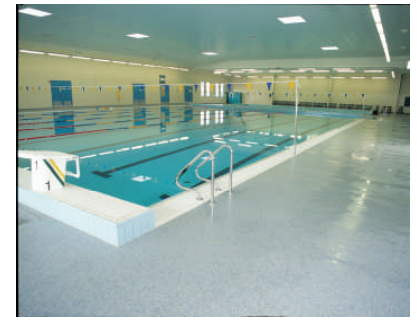
Rubber Granite...loves getting wet and keeping things safe around pools

By using Regupol® recycled rubber flooring products you are not only using a fantastic product...you are also using a product that is environmentally conscious...one that improves the quality of all environments.