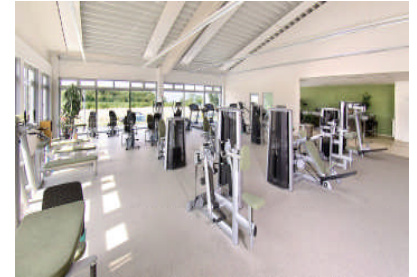
Everroll is fit for purpose in gymnasiums