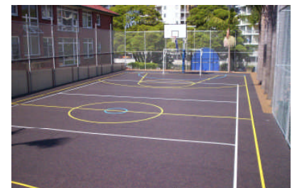
Everroll Classic is scratch resistant and durable...perfect for outdoor play areas