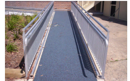
Everroll...increases the safety of this ramp due to its excellent slip resistance