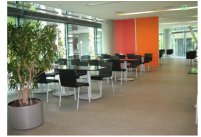
Everroll is the perfect resilient flooring solution for classrooms, cafes and canteen areas, corridors and entries