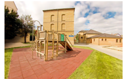
Regupol® rubber pavers offer impact protection in playgrounds